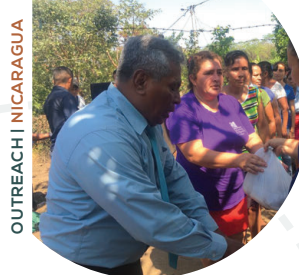
OUTREACH | NICARAGUA