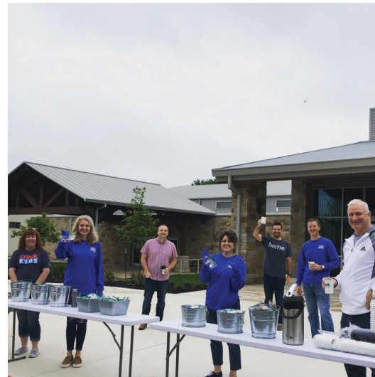
Church Staff | 2020 Easter Packet Pickup

HOW we celebrated Easter this year was DIFFERENT but WHY we celebrate is the SAME