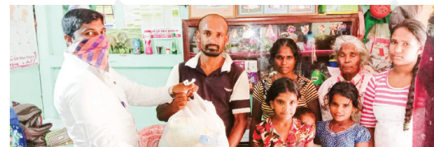
FOOD DISTRIBUTION | SRI LANKA