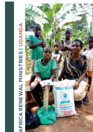
AFRICA RENEWAL MINISTRIES | UGANDA