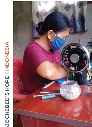
JOCHEBED'S HOPE | INDONESIA