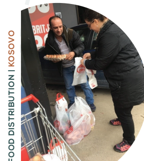
FOOD DISTRIBUTION | KOSOVO