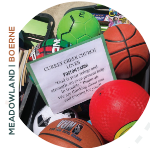
MEADOWLAND | BOERNE